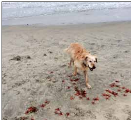
Pua the Golden Retriever with Tuna Crabs at Del Mar Dog Beach, June 2015. A portent of the current El Nino.

Happy New Year to our Southern California Section membership!