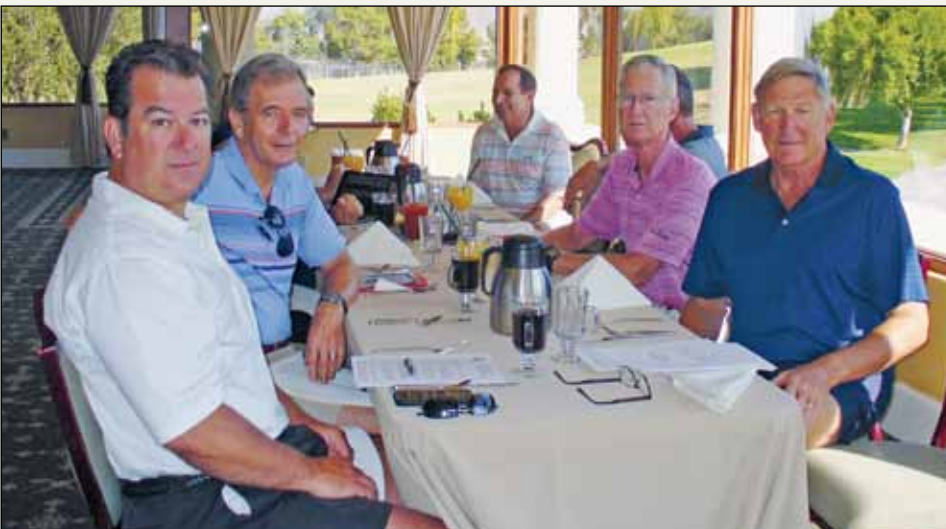
Your hardworking ACD Section Board of Directors at March 31 Board meeting.