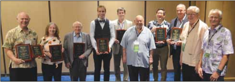
ICD Journalism award winners at the American Association of Dental Editors and Journalists (AADEJ) annual meeting in Honolulu, October 2018