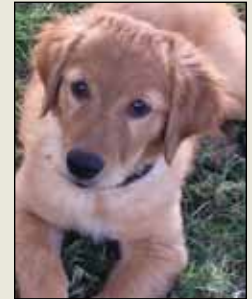
Golden retriever puppy Makai with his great great aunt Pua.

and middle aged dental utilization is flat. However, high income elderly are increasing their use of dental services. Some are the patients of those older Delta Premier dentists, happy to continue paying Premier fees. Some can afford to pay out of pocket, fee-for-service and some see older dentists who don’t participate with any plans. Those lucky older dentists are happy to ride out that wave of high utilizing high income older patients in their practices until they retire.